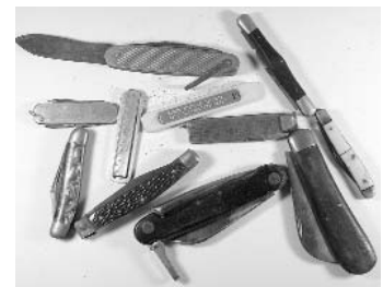
Lot 2559, 2561 and 2560, respectively.

2561. Guns & Weapons. Two Billy Clubs. One is a wood club c. 1880. The other is a metal pipe club c. 1920-60. Est. $100-200